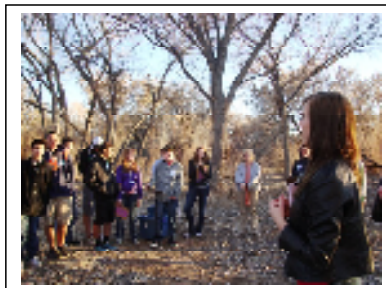
Image 3: Students work with BEMP staff, the Environmental Education Association of New Mexico and the Sierra Club's Building Bridges to the Outdoors program to help compile a list of OUTDOOR opportunities that every New Mexico child should have the chance to participate in.

Image 2: Students from local high schools create journal entries based on thoughts and images of the bosque.