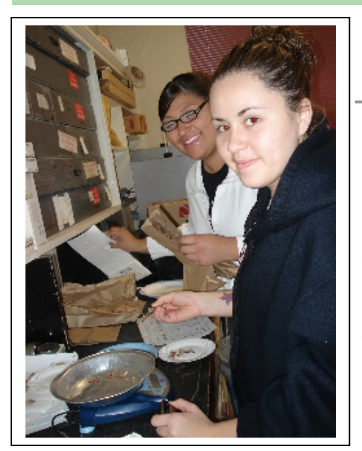
Students from School on Wheels visit the BEMP offices at UNM campus to help sort the leaf litter they collected throughout the year!