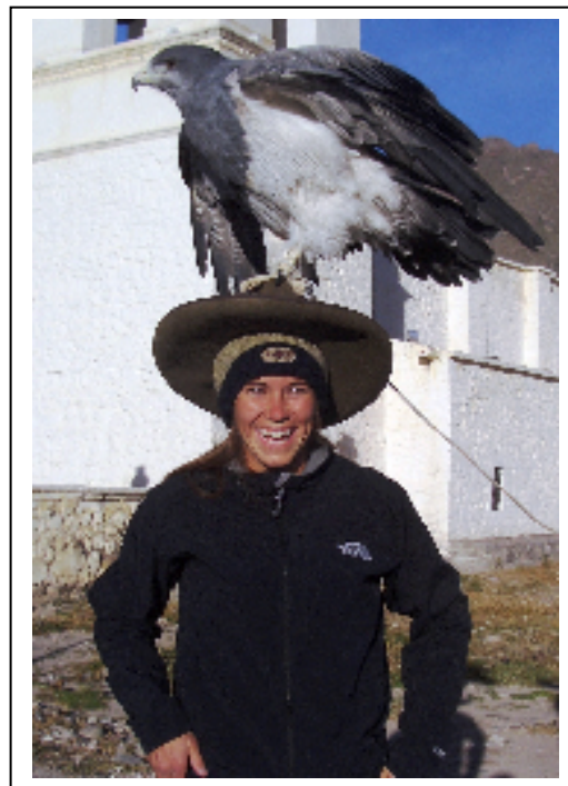
Above: Oh, and in case you were wondering... yes the bird on my head is real, and it is called the black-chested buzzard eagle (photo taken in Peru).