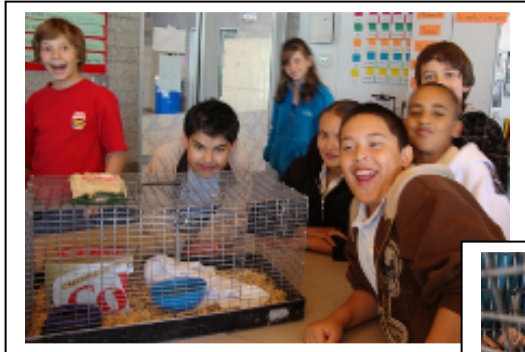
Above: Students enjoy learning about animal adaptations with the City of Albuquerque's Zoo to You program.

Right: A special highlight was the prickly hedgehog that had kids giggling all day!