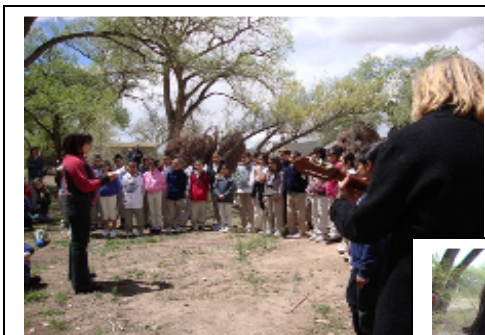
Above: Dolores Gonzales Elementary students sing a beautiful song about the bosque at lunchtime.

Right: Students check out track tracks, scat and skulls at the City of Albuquerque Open Space table.